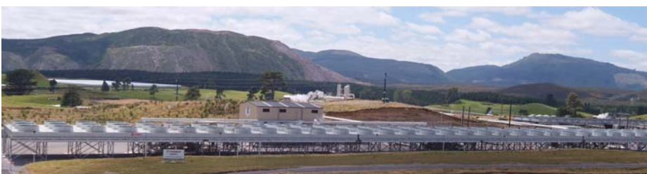
Mokai II Power Station with glimpse of Gourmet Mokai glasshouse behind

Construction of Mokai II commenced in 2002 and the project was finalised in June 2005. Both Mokai I and Mokai II uses equipment supplied by Ormat. Mighty River Power is a 25% shareholder, and continues to operate as Tuaropaki's Operations Maintenance contractor.